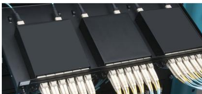
FAS-NET MPO Modular Sliding Patch Panel 1U