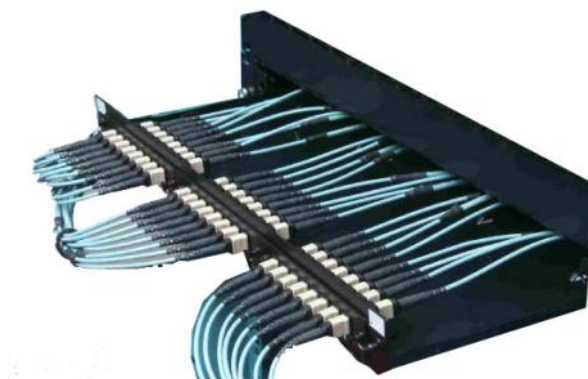
FAS-NET MPO Modular Sliding Patch Panel 1U with MTP Adapter Plates