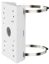
Pole Bracket IBBCPM