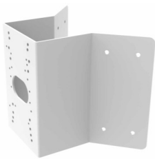
Corner Bracket IBCRWM