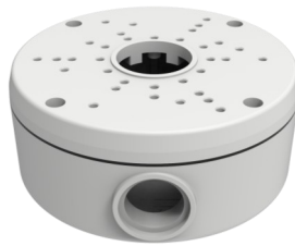
Junction Box IBBWM-134