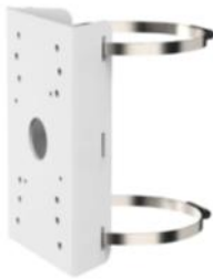
Pole Bracket IBBCPM