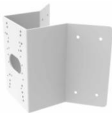
Corner Bracket IBCRWM