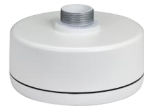
Junction Box IBBCEM-134