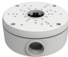
Junction Box IBBWM-134