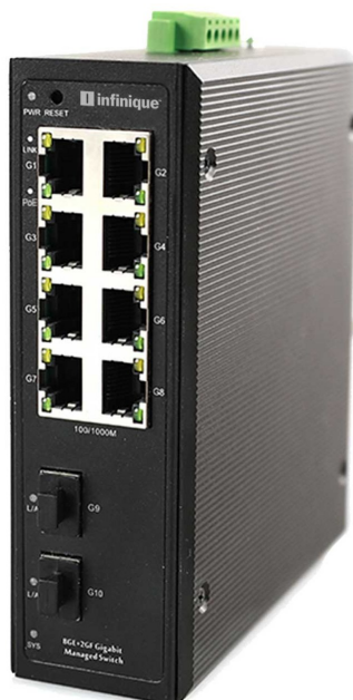
Dimensions Width: 47mm Height: 145 mm Depth: 134.5mm