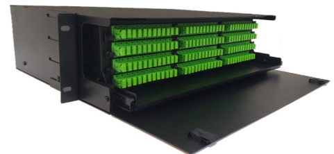
IFRMPP144SCS Fiber Patch Panel, 144 Ports SC Simplex