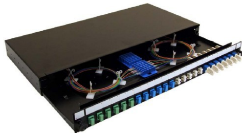
IFRMPP24SCS Fiber Patch Panel with 24 Ports SC Simplex