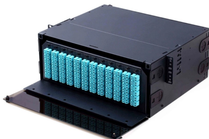
IFRMAP144SCD Fiber Patch Panel, 144 Cores SC Duplex