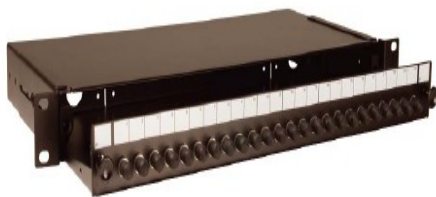
IFRMPP24STS Fiber Patch Panel with 24 Ports ST/FC