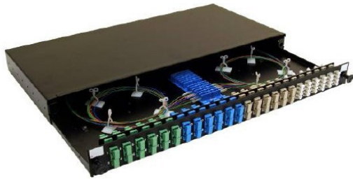
IFRMPP24SCD Fiber Patch Panel with 24 Port SC Duplex