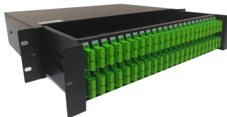
IFRMPP48SCD Fiber Patch Panel, 48 Ports SC Duplex